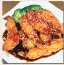
Crispy Shrimp w/ Sesame Seed Delicately seasoned jumbo shrimp, lightly fried to golden brown in the chef's choice special sauce lunch 10.99 dinner 13.99