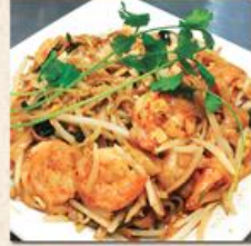
Pad Thai Chicken, pork or veggie 11.99 Beef 12.99 Shrimp or house 13.99