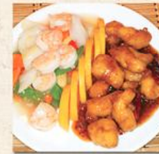
Dragon & Phoenix General tso's chicken & peking shrimp 14.99