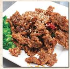
Crispy Beef Shredded crispy beef w/ sesame seed & sweet sauce on top lunch 9.99 dinner 14.99