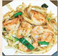
Lemon Grass Sauce Chicken, pork or tofu 11.99 Beef 12.99 Scallop or shrimp 13.99