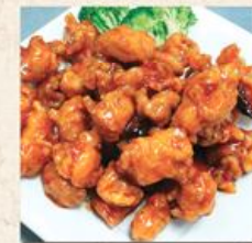
Orange Chicken Chicken in orange flavored sauce lunch 8.29 dinner 11.99