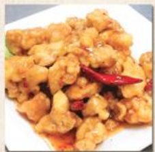
General Tso's Chicken Chicken w/ spicy tangy sauce lunch 8.29 dinner 11.99