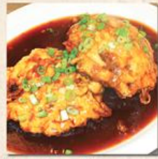
Egg Foo Young Chicken, pork or vege 11.99 Beef or shrimp 12.99 House 12.99