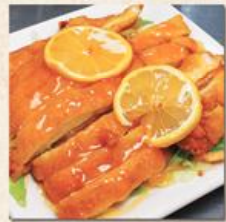
Lemon Chicken Deep fried chicken breast cut in small pieces served w/ lemon sauce lunch 9.99 dinner 12.99