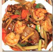
House of Garlic Sauce Shrimp, chicken & beef 13.99