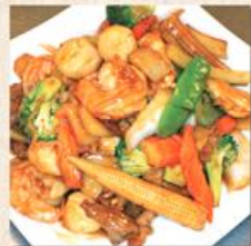
Family Delight Jumbo shrimp, scallop, crab stick, chicken, beef & veggies w/ chef's special brown sauce 14.99