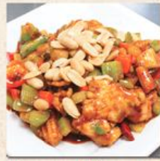
House of Kung Pao Shrimp, chicken & beef 13.99