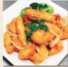
Watermoon Glazed chicken or shrimp w/ honey-butter sauce Chicken lunch 8.49 dinner 11.99 Shrimp lunch 9.99 dinner 13.99