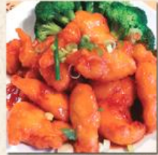
Crispy Chicken Hot Garlic Sauce or Shrimp Garlic Sauce Chicken lunch 8.29 dinner 11.99 Shrimp lunch 9.99 dinner 13.99