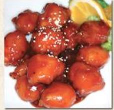
Pon Pon Chicken Fried chicken breast coated w/ sweet dressing lunch 8.29 dinner 11.99