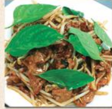
Thai Basil Chicken, pork or veggie 11.99 Beef 12.99 Shrimp or house 13.99