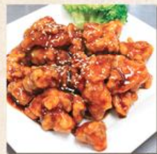
Sesame Chicken Chicken sauteed w/ special sesame sauce lunch 8.29 dinner 11.99