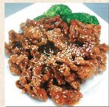
Sesame Beef Tendered beef in sesame flavored sauce lunch 9.99 dinner 14.99