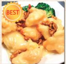
Walnut Shrimp or Walnut Chicken Shrimp lunch 10.99 dinner 13.99 Chicken lunch 8.99 dinner 11.99