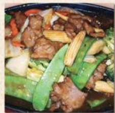
Mandarin Sizzling Chicken or pork 12.99 Beef or shrimp 13.99 House (shrimp, chicken, beef) 14.99