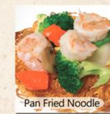
Pan Fried Noodle