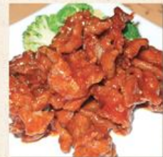
Orange Beef Tendered beef in orange flavored sauce lunch 9.99 dinner 13.99