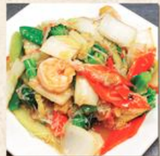
Seafood Combination Jumbo shrimp, scallop, crab stick, vegetables w/ homemade white sauce 14.99