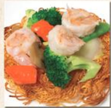
Pan Fried Noodle Chicken, pork or veggie 11.99 Beef 12.99 Shrimp or house 13.99