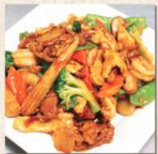
Triple Delight Jumbo shrimp, chicken, beef, veggies sauteed in brown sauce 13.99